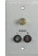
AL152xx One BNC & Two 1/4" T.R.S