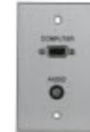
AL184xx One BTX 9532HD & one ORA CJS3