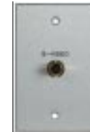
AL167xx One S Video