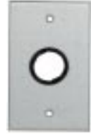
AL116xx 1.25" Heyco Grommet