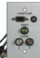
AL197xx One 15 pin to 5 BNC tails, 3.5mm Solder, RCA to BNC Two RCA (red/white)